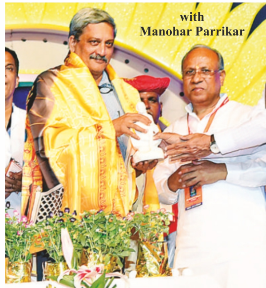
with Manohar Parrikar

WiFi for entire Shirdi township, Construction of Modern Educational Complex spanning over 7.0 lakh sq.ft. to accommodate temple run schools/colleges having 6000 students, Advanced Darshan Queue Complex spanning over 3.0 lakh sq.ft. to support more than 30,000 devotees and upgradation of Saibaba Hospitals with newly procured 128 high end machinery and equipment.