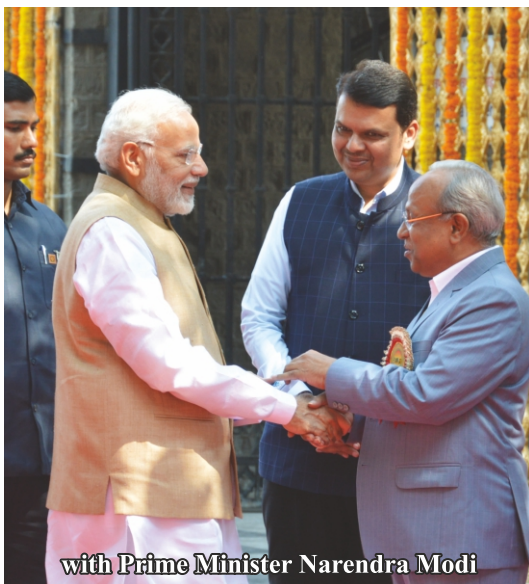
with Prime Minister Narendra Modi

at the hands of Hon Shri Ramnath Kovind, President of India , Commencement of FM 103.7 special AIR radio station for Shirdi, Free