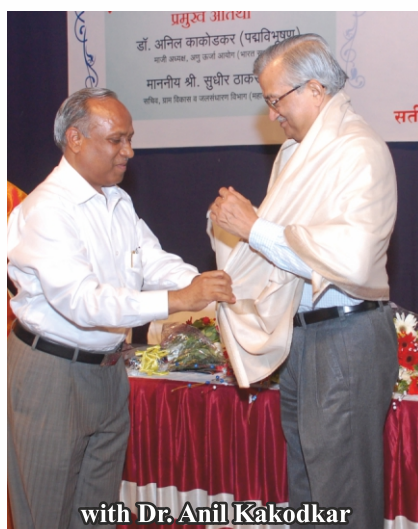
with Dr. Anil Kakodkar