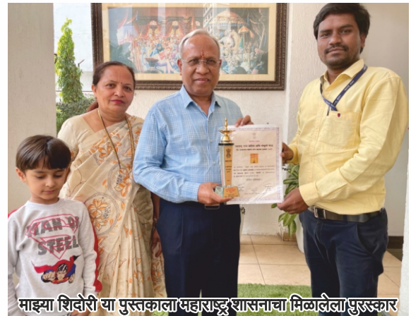
माझ्या शिंदेरी या पुस्तकाला महाराष्ट्र शासनाचा मिळालेला पुरस्कार