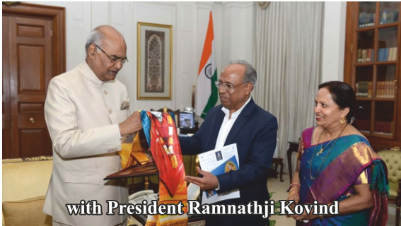
with President Ramnathji Kovind